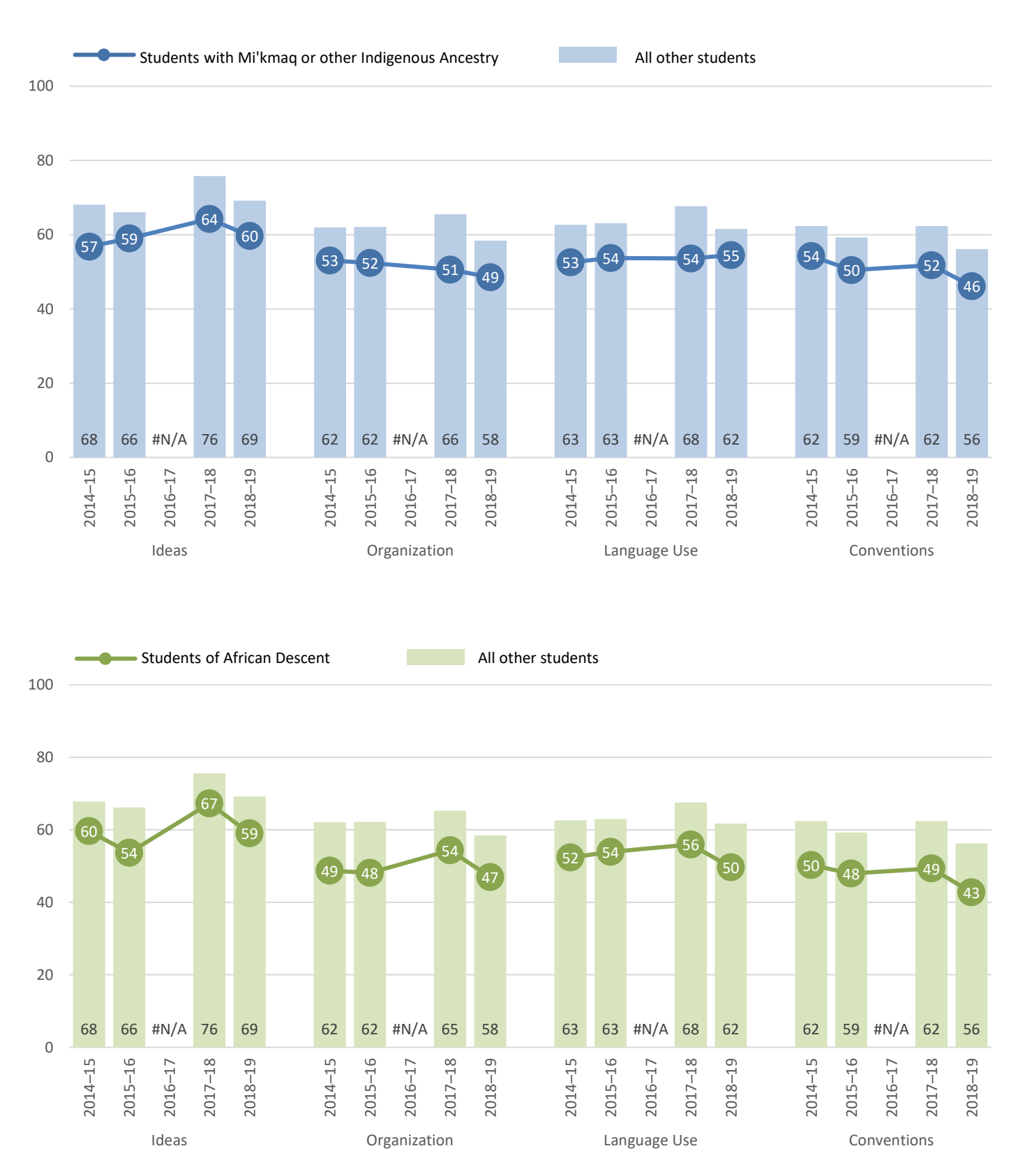
#N/A - Assessment or Examination was not administered during this reporting period.

Percentage of students at or above the expectation by self-identified group and year